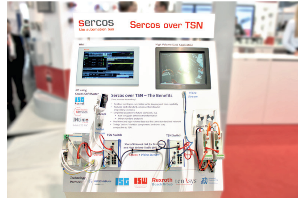
Figure 2: "Sercos over TSN" demonstrator at SPS IPC Drives show in November 2016

Ethernet TSN makes time-controlled and deterministic transmission of real-time-critical messages possible for the first time in the 43-year history of unmodified Ethernet. Ethernet TSN uses the principle of time-triggered and time-slot based communication, which Sercos® has already used for more than 25 years for real-time communication for all kind of production machines and high-performance automation, and beyond. The advantages of using Ethernet TSN in an automation system are obvious: instead of special hardware, standard Ethernet components with integrated real-time capabilities can be used (see Figure 1). The cross-industry support (automotive, multimedia, automation) of the TSN technology results not only in low costs, but also the availability of a wide range of manufacturers and products. At the same time, manufacturers and users benefit from the newest technical developments such as higher transmission rates. With TSN, the convergence of production and IT networks can be advanced, i.e. real-time communication and normal Ethernet communication can be transmitted via a uniform network standard. This constitutes an ideal basis for the implementation of Industry 4.0 and IIoT concepts.